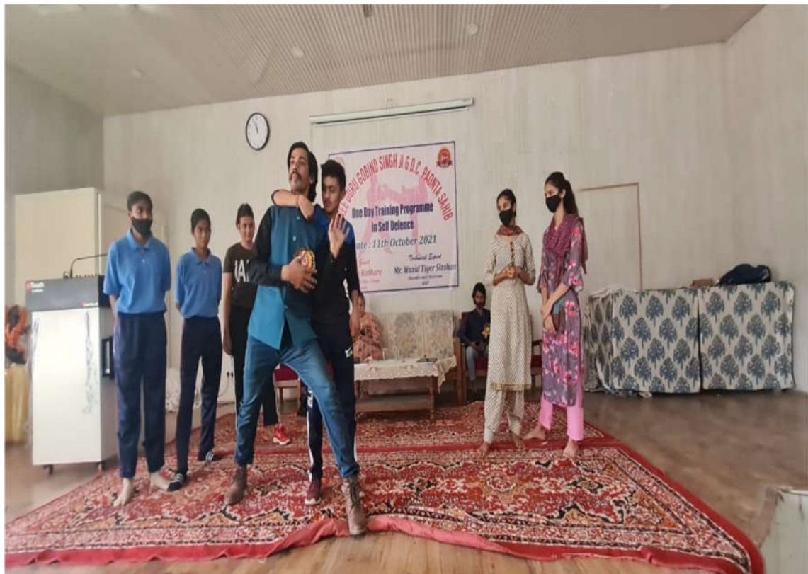
Photograph 25 Self Defense Training Programme in MPH