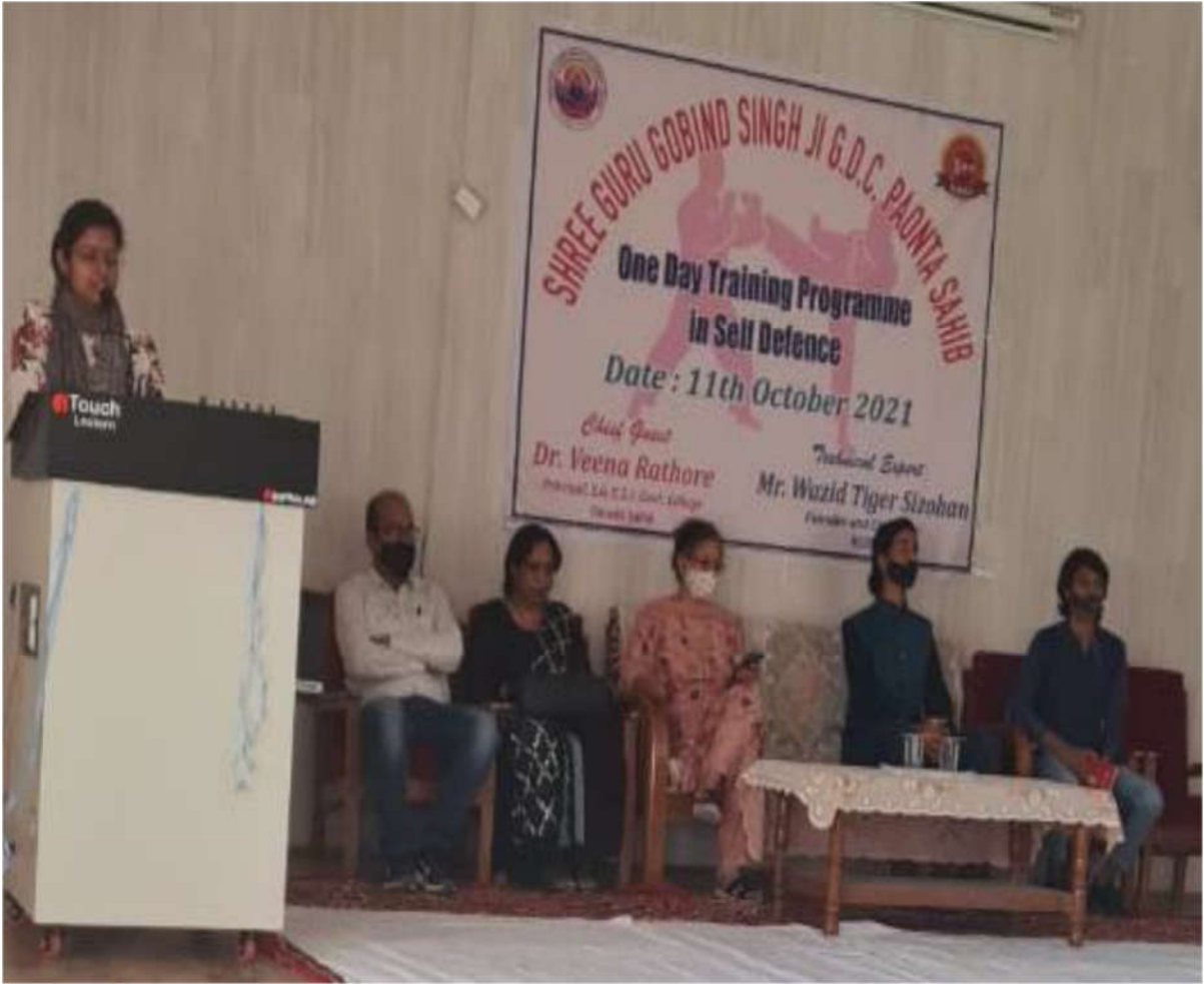
Photograph 22 Self Defence Training Programme in MPH