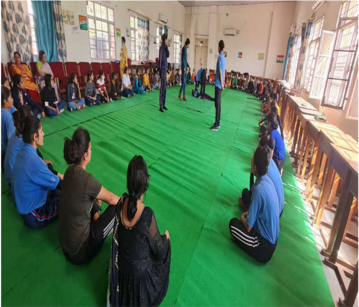
Photograph 23 Self Defense Training Programme in MPH