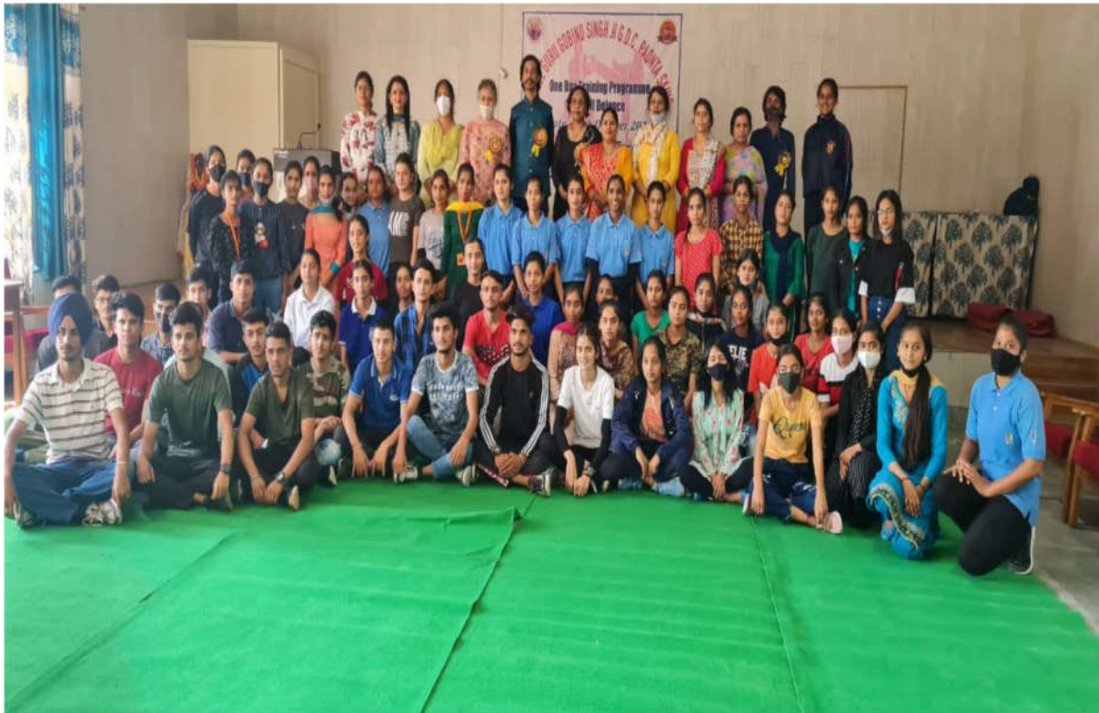
Photograph 24 After Self Defense Training Programme in MPH